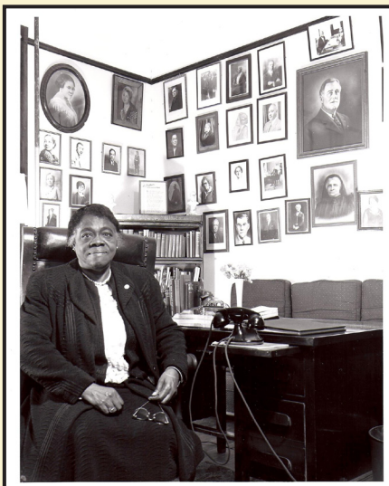
Photo of Mary McLeod Bethune