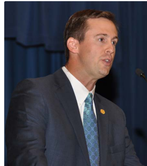
Senator McElveen delivers the Honors

Senator McElveen encourages honor students to be leaders who care about service