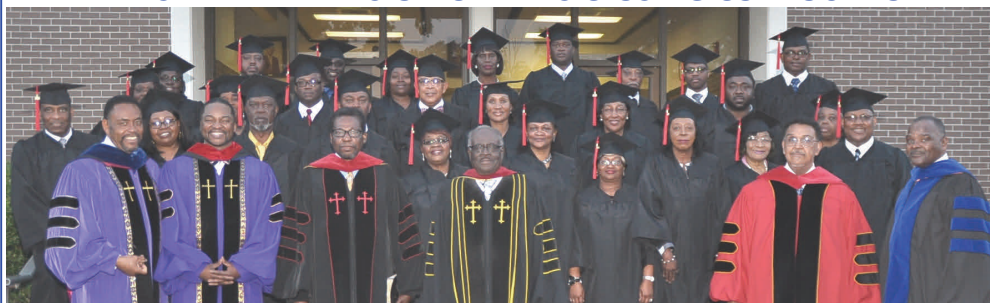
Above: Students graduating from Aiken, Andrews, Charleston, Columbia, Kershaw, Pineville and St. George Ministerial Extension Certificate Centers with instructors