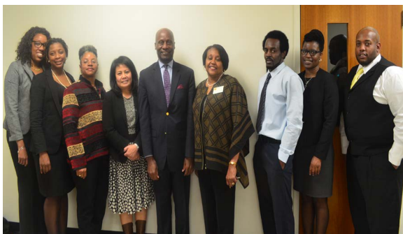
Organizational Management students pose with professors and the academic dean after presenting their capstone presentation. The organizational management program is specially designed to cater to the working adult.