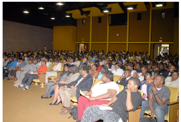
The campus community gathers for kick-off assembly.

The official Fall Harvest Worship Service and Rally, along with the parade, will be held on Saturday, November 20, 2010.