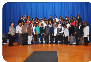
Honor students recognized at Spring Honors Convocation.