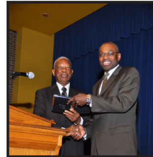
Picture taken at Thursday's assembly