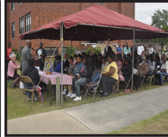
Students, staff, and faculty listen intently to the reading of the Constitution.