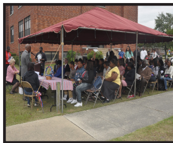
Students, staff, and faculty listen intently to the reading of the Constitution.