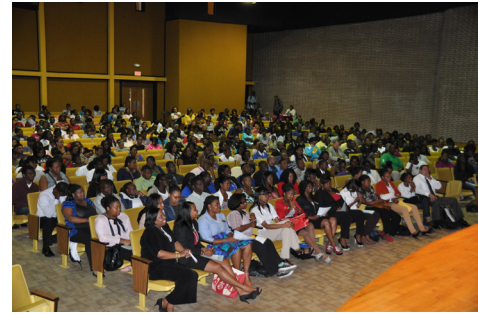
Campus Community at Kick-off Rally.