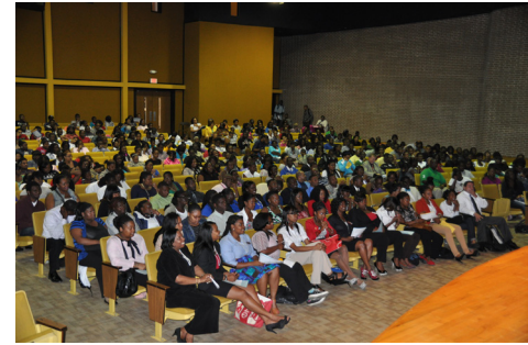
Campus Community at Kick-off Rally.